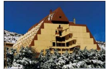
Club Louka Morocco

Known as The Quality Vacation Exchange Network®, Interval International® has operated exchange and membership programs for vacation owners worldwide for more than 32 years. Interval has a network of over 2,400 resorts in more than 75 countries and serves approximately 2 million member families.