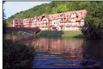
Le Manoir des Deux Amants France