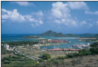
Jolly Harbour Beach Resort Antigua