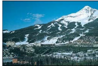
Big Sky Resort Montana